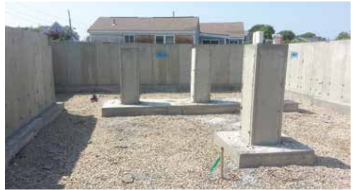
Construction projects along the coast or in other areas with a high risk of flooding are subject to following FEMA's regulations, including a flood proof foundation such as the one pictured here.

New construction within a flood zone requires creating a foundation that has the ability to allow water to pass through, rather than building up hydrostatic pressure against outside walls, potentially leading to structural failure, and typically eliminates the ability to have a full basement. Velocity zones are areas subject to wave action, not just flooding, and have much more strict requirements; being built on pilings for example.