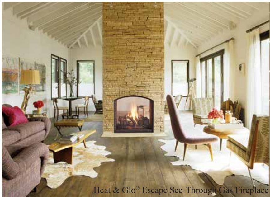
Heat & Glo® Escape See-Through Gas Fireplace

be worried about fly away sparks or flames. Also, there are no fumes or particles released into the air in your home as they are vented outside. There are several options available so that a gas fireplace can easily be added to any home, even if there isn't an existing chimney.