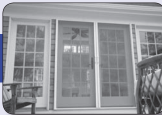
Phantom Retractable Screens

For all of your Screen needs, Phantom Screens, Awnings, Canopies, Hurricane Shutters, Solar Shades & Window Film